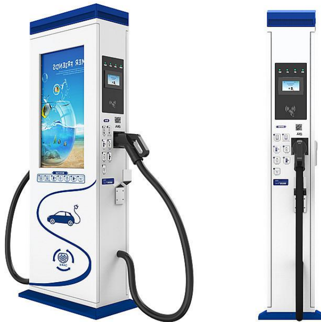
30KW Floor-type DC Charging Pile